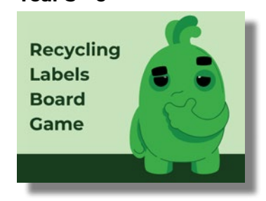
Year 5 - 6