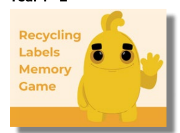
Year 1 - 2