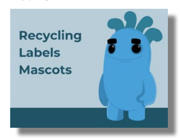
Year 3 - 4