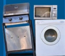
Other metal items